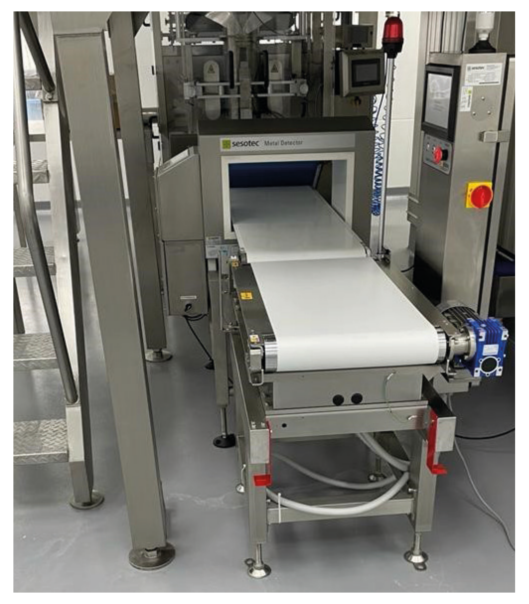
GLS 450/250 GO DUO metal detector from Sesotec can be easily integrated into an existing production line.

In the food industry, product safety is a top priority. Producing safe food is a complex task and involves many challenges. One of these challenges is the detection of metallic foreign objects. Only metal detectors with the latest technology guarantee the best detection performance and thus contribute to the quality of the products.