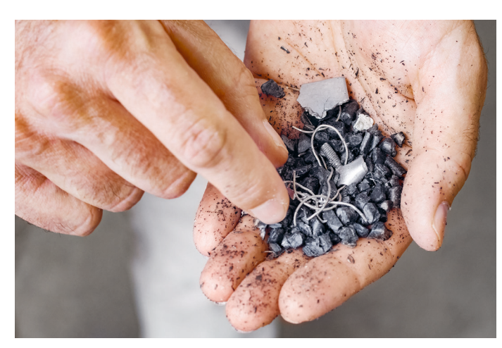
The RE-SORT metal separation unit for post-cleaning of heavily contaminated material

Integrated version: The RE-SORT metal separation unit can also be used within the central material handling system, where it acts as a metal pre-cleaning station.