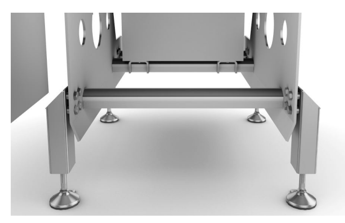
Robust and hygienic design even for harsh production environments

NEXWEY checkweighers can be supported with a number of service packages to improve performance, improve machine uptime and meet audit requirements.