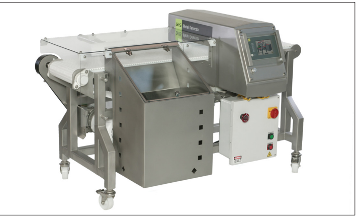
Optional reject bin for safe storage until OA can identify contaminants