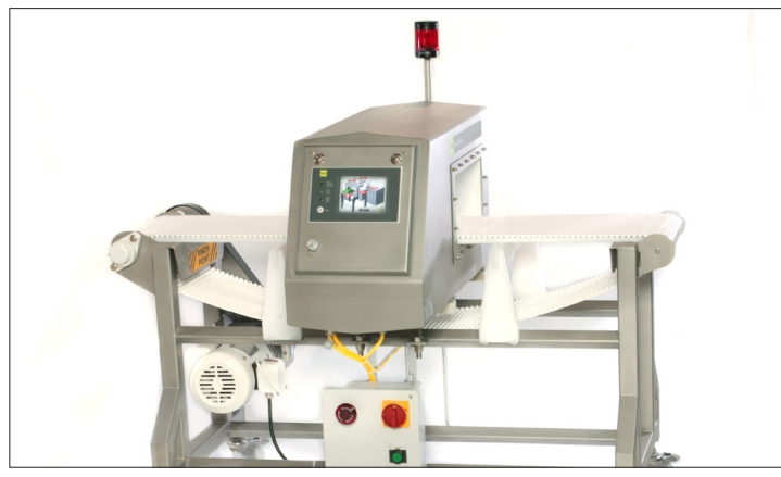
Easy to Clean and Sanitize in Minutes