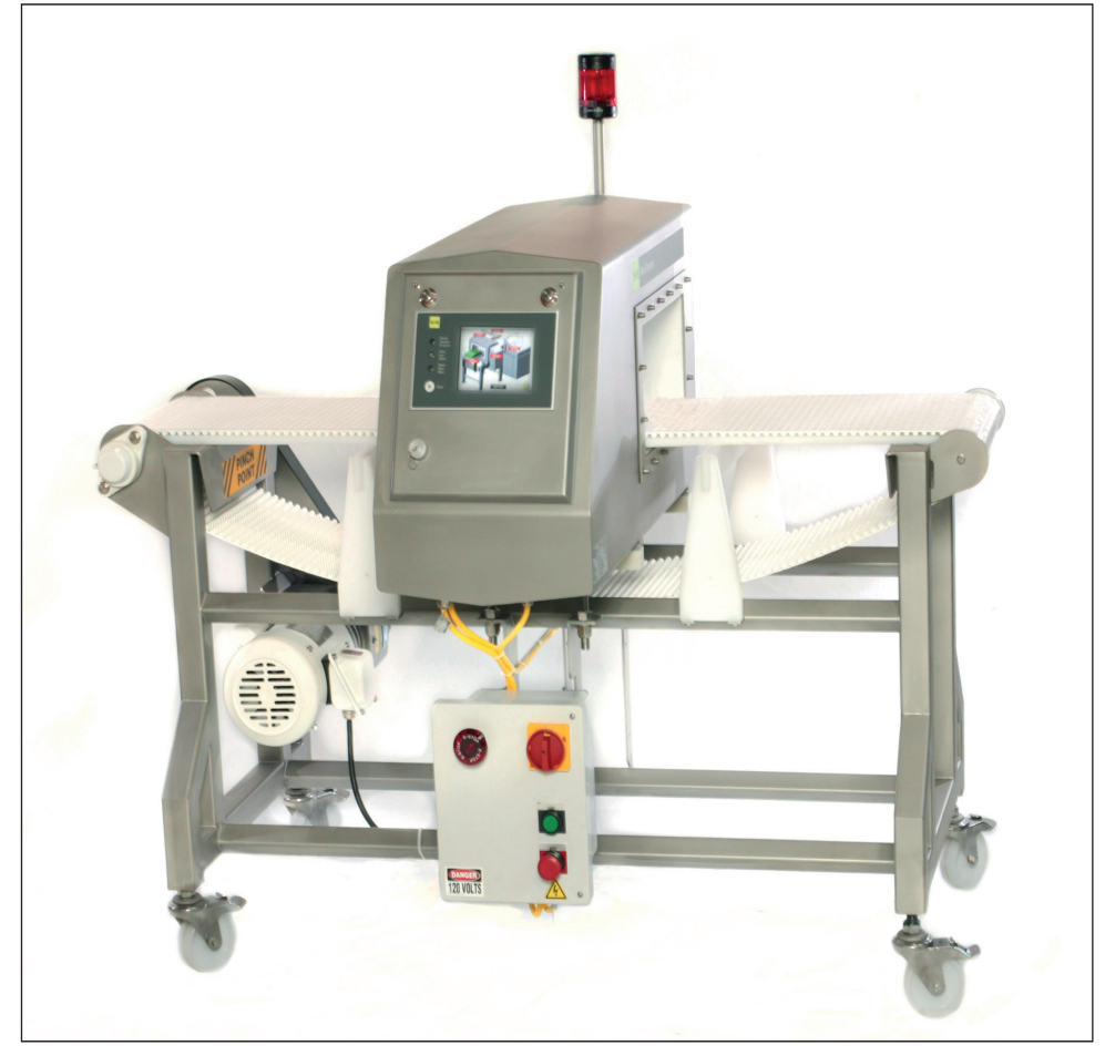
Standard systems, customized to suit specific customer requirements