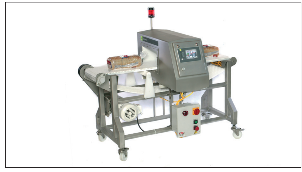
GENIUS+ SANICON Conveyor – Setting higher standards in food safety