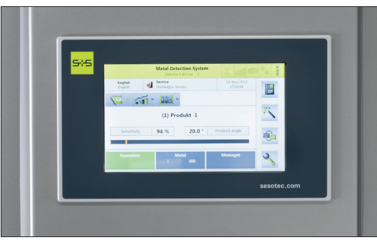
7" Color touch user interface with enhanced graphics