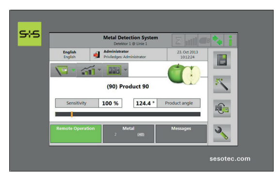
At-a-glance view of production statistics