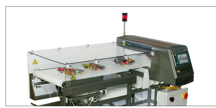
Slide retract for bulk-flow, multi-lane application