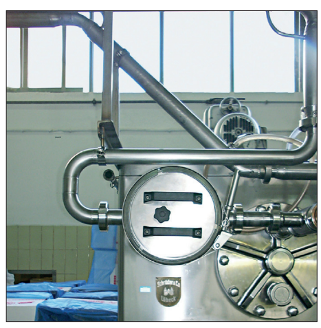
LIQUIMAG magnetic separator installed in a pipeline.