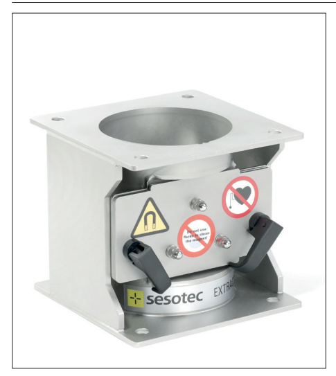
EXTRACTOR-SE in reinforced version