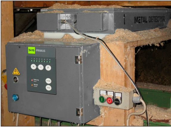
Installation example: Plate type detector ELS with control unit PRIMUS analysing wood off-cuts (old version)