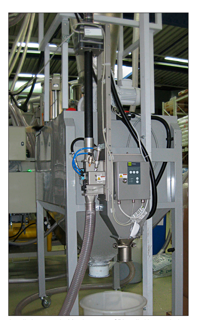
Installation example: Metal separator GF installed in a vertical pipeline (old version)

It detects all magnetic and non-magnetic metal contaminants (steel, stainless steel, aluminium, etc.) - even when they are enclosed in the product. Metal contaminants are ejected via the "Quick-Flap" separation unit.