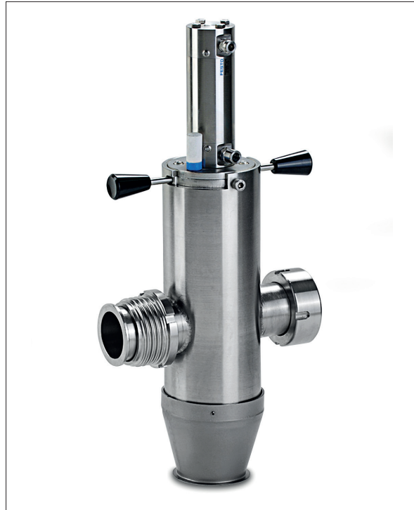
Separating system: Piston valve