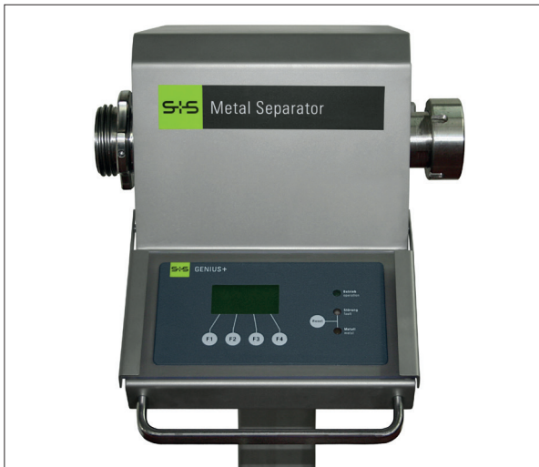
LIQUISCAN VF+ with thread connections RD 80x1/4" female/male for vacuum filler e. g. Vemag HP-Serie, Frey E 80, Risco RS 4000 etc.