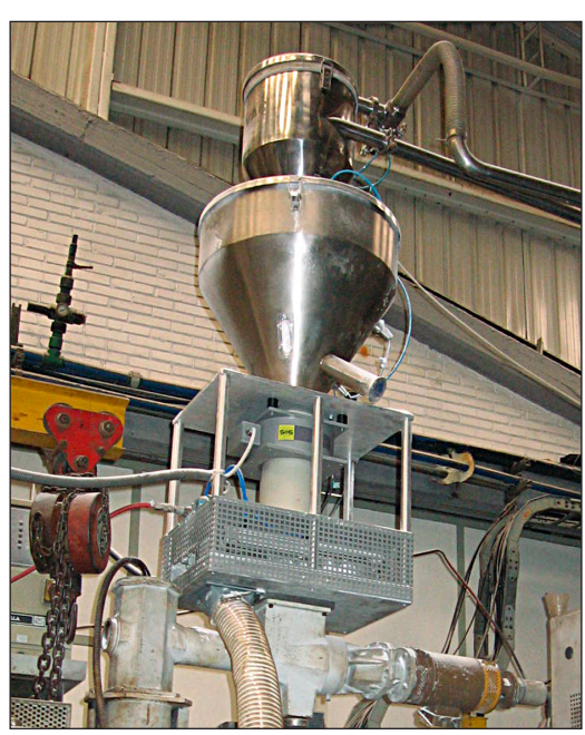
Installation example: Metal separator installed at the material infeed. (old version)

PROTECTOR-MF metal separators increase machine availability and productivity providing a fast return on investment.