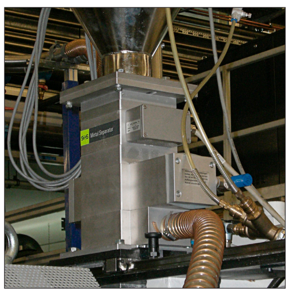
Installation example: Metal separator PROTECTOR installed over the feeder of an injection moulding machine (old version)

It detects all magnetic and non-magnetic metal contaminants (steel, stainless steel, aluminium, etc.) – even when they are enclosed in the product. Metal contaminants are ejected via the "Quick-Flap" separation unit.