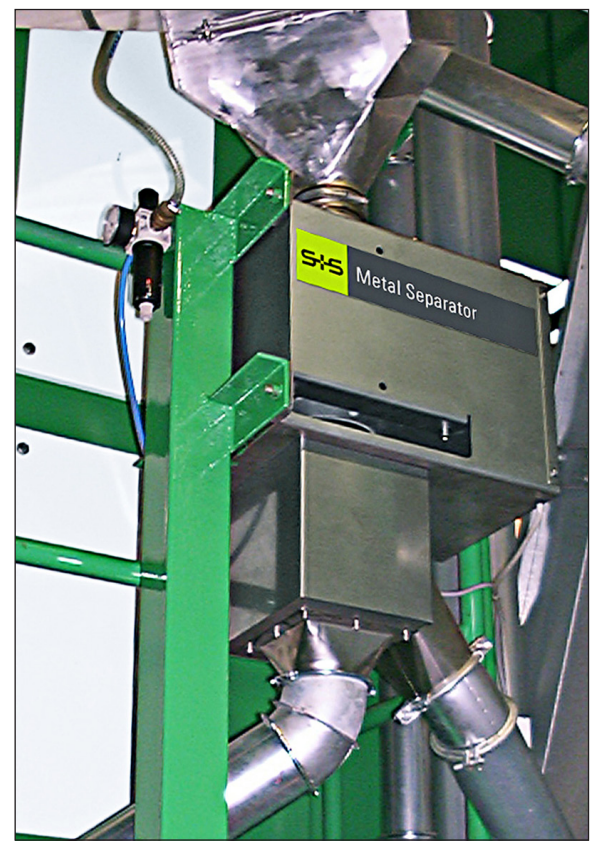
Installation example: Metal separator RAPID 4000 used for quality control at a filling station for dried vegetable. (old version)

Sesotec GmbH Regener Straße 130 D-94513 Schönberg Germany Tel: +49 8554 308-0 Fax: +49 8554 2606 info@sesotec.com www.sesotec.com