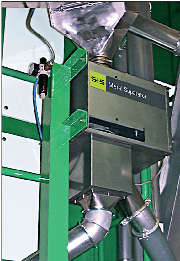
Installation example: Metal separator RAPID 4000 used for quality control at a filling station for dried vegetable. (old version)