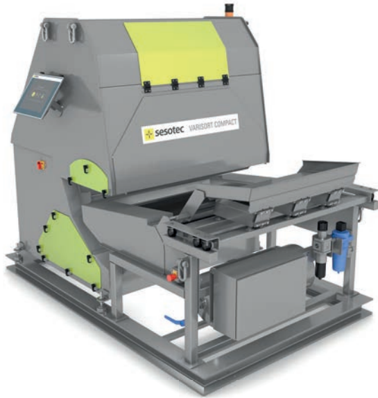
VARISORT COMPACT for fine fractions