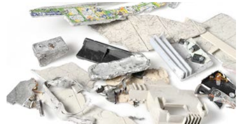
N-Sensor – Recovery of engineered plastics