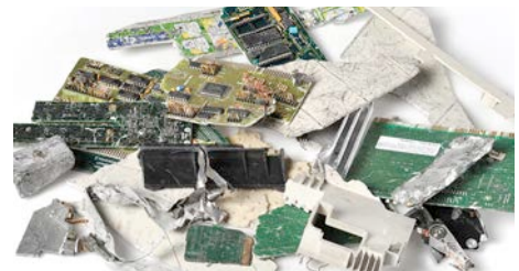
CMN-Sensor – All in one