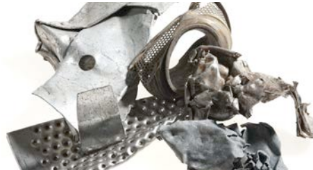
M-Sensor – Recovery of metals