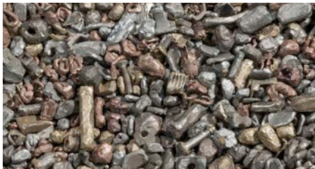
C-Sensor – Color separation