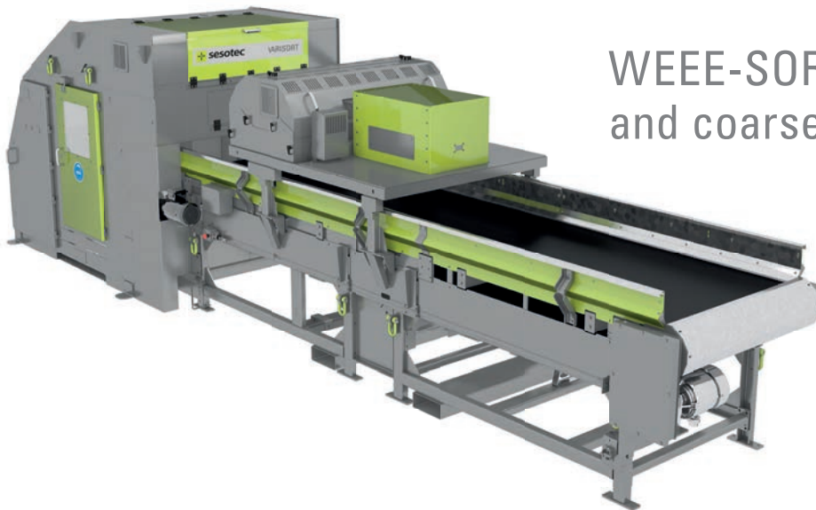
WEEE-SORT for middle and coarse fractions