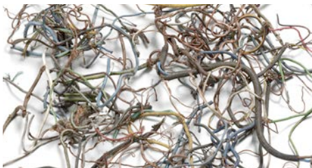
CM-Sensor – "Inverse Sorting" technology with shape recognition