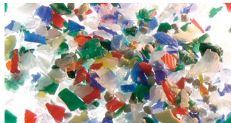
CN-Sensor – Off-color and material separation