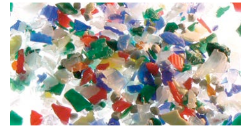
CN-Sensor — Off-color and material separation