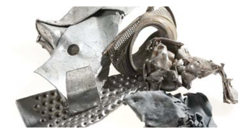
M-Sensor – Recovery of metals