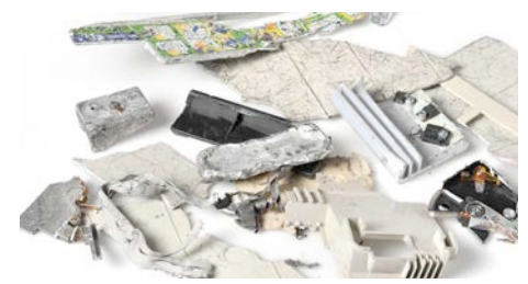
N-Sensor – Recovery of engineered plastics