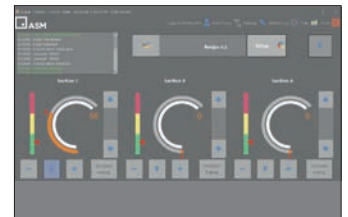
Ease of use through true color setup