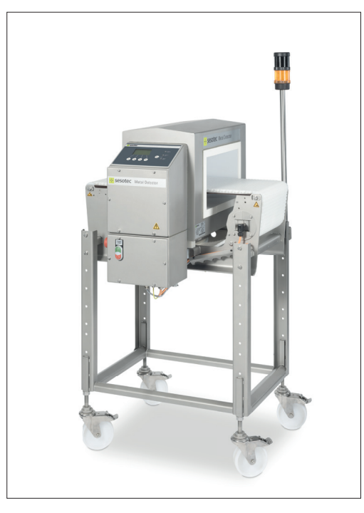
VARICON COMPACT The short metal detection system with conveyor belt and GLS metal detector.