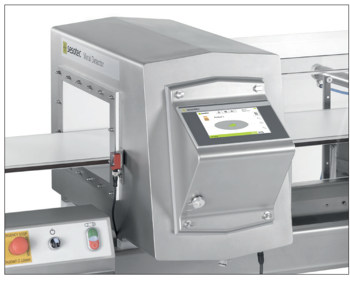
INTUITY Metal detector with highest metal detection performance and a high level of usability.

Metal detectors that are integrated in conveyor belt lines primarily are used for the incoming and outgoing inspection of packaged bulk materials and of individually packed materials. They can be combined with many types of customer-specific separating units (air blast nozzles, pusher, separating slides, ...). Complete systems — comprising conveyor belt, metal detector, and separating unit — guarantee highest operating reliability and detection accuracy.