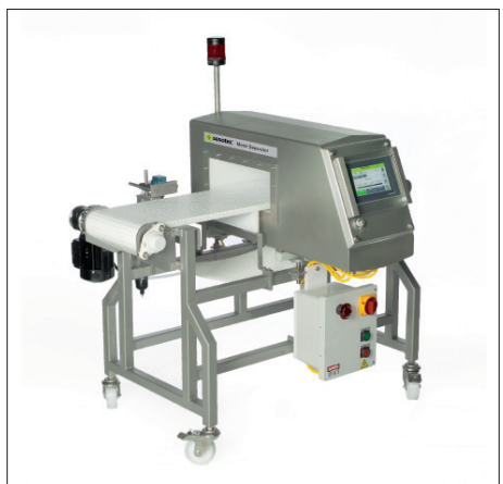
RAPICON with C-Scan GHF metal detector Standard range with quick delivery to meet strict food safety standards.

High performance metal detection conveyor systems that incorporate many features related to Food Safety and Sanitary design requirements.