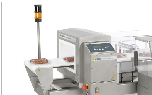
VARICON+W with GLS and with linked belt for the inspection of packed piece goods in wet areas.