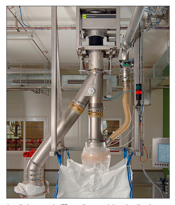
Installation example: IFS compliant metal detection directly before the filling of spice products into bigbags. (old version)