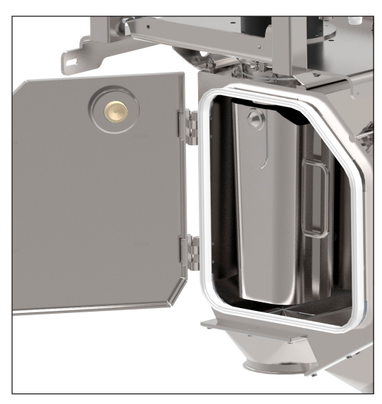
Separation unit with opened cleaning flap.

The RAPID 6000 metal separator primarily is used in industries with high hygienic demands.