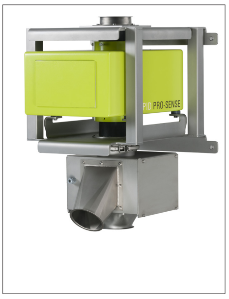
Standard reject unit "Quick-Flap"