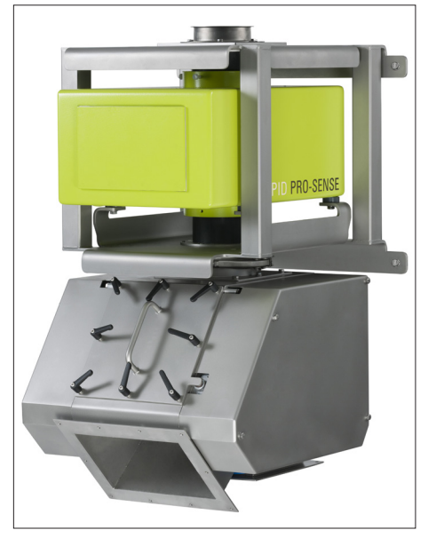
Round reject unit for powder