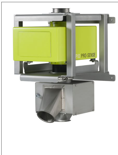
Standard reject unit "Quick-Flap"