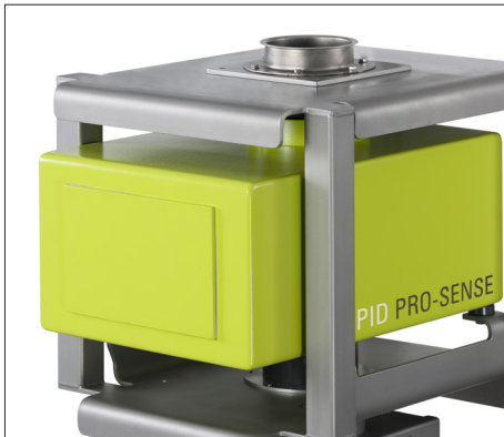
Detection unit with innovative HRF technology

The detection unit with innovative HRF technology (High Resolution Frequency) was developed especially to ensure an optimal scanning sensitivity for all metals. The detection signal is transmitted with a special frequency and evaluated. In addition to ferrous and non-ferrous metals, even smallest particles of non-magnetic stainless steel can now be detected and separated even more efficiently.