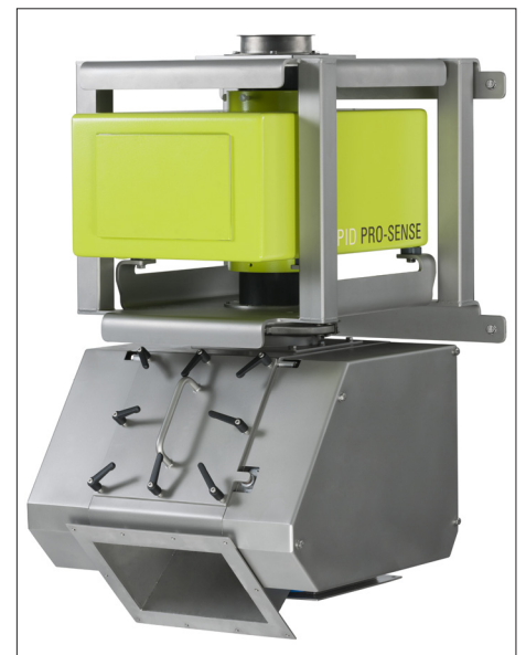
Reject unit with swivel hopper for special materials (Image contains options)