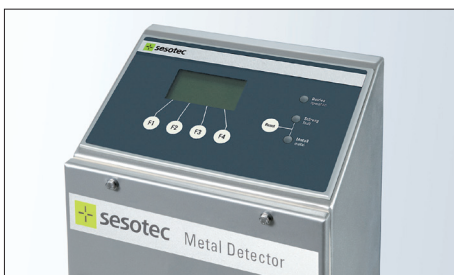
Electronic Control Unit GENIUS+