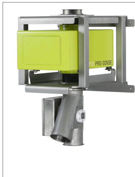
Round reject unit for powder